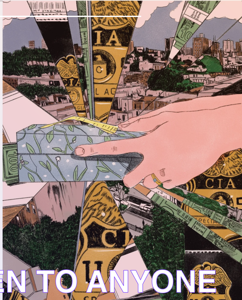
Illustration: Nicole Rifkin